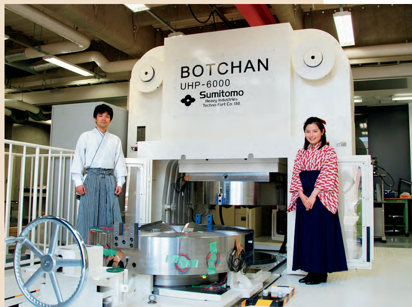
Figure 3. The GRC's large-volume, multi-anvil press uses a 6,000-tonne hydraulic ram to synthesize NPD rods up to 1 cm long. The two young GRC staff members are wearing traditional costumes from a famous Japanese novel set in Matsuyama, the city where the facility is located.

What is the significance of the prefix “nano”? Consider that the diameter of a human hair is somewhere between 50,000 and 100,000 nm. NPD is actually a mixture of two forms of synthetic diamond: 10–20 nm equigranular crystallites and 30–100 nm lamellar crystalline structures (Sumiya and Irifune, 2005). Both are formed during a sintering process used to convert pure graphite directly into cubic synthetic diamond in a matter of minutes (Irifune et al., 2003). How is this possible? The GRC utilizes a 6,000-tonne multi-anvil apparatus (figure 3) to achieve the required pressure of 15 gigapascals (2.18 million psi) and temperature of 2,300–2,500°C (Irifune et al., 2003; Irifune and Hemley, 2012). Interestingly, lower temperatures in the 1,600–