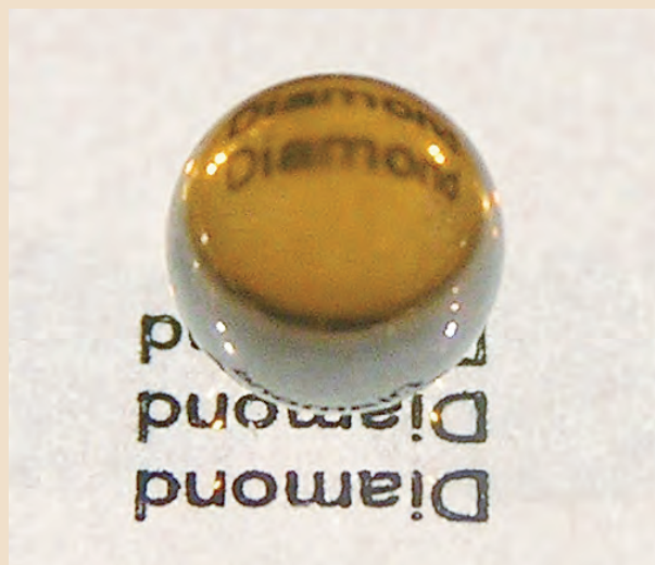
Figure 1. As this photo demonstrates, NPD is completely transparent. When placed over text on a piece of paper, the 5.09 mm sphere reverses and transmits the letters so that they are clearly legible.

The creation of a 7.5 mm NPD orb, described as the world's "first spherical diamond" (Yamada and Yashiro, 2011), was announced in October 2011 by one of Japan's largest newspapers ("Ehime Univer-