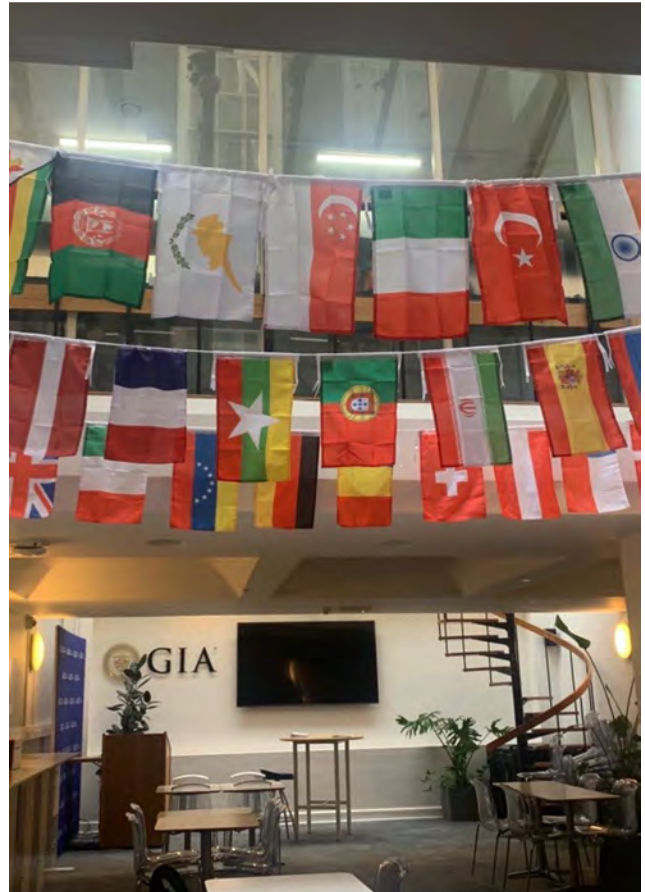
Student lounge on the London campus