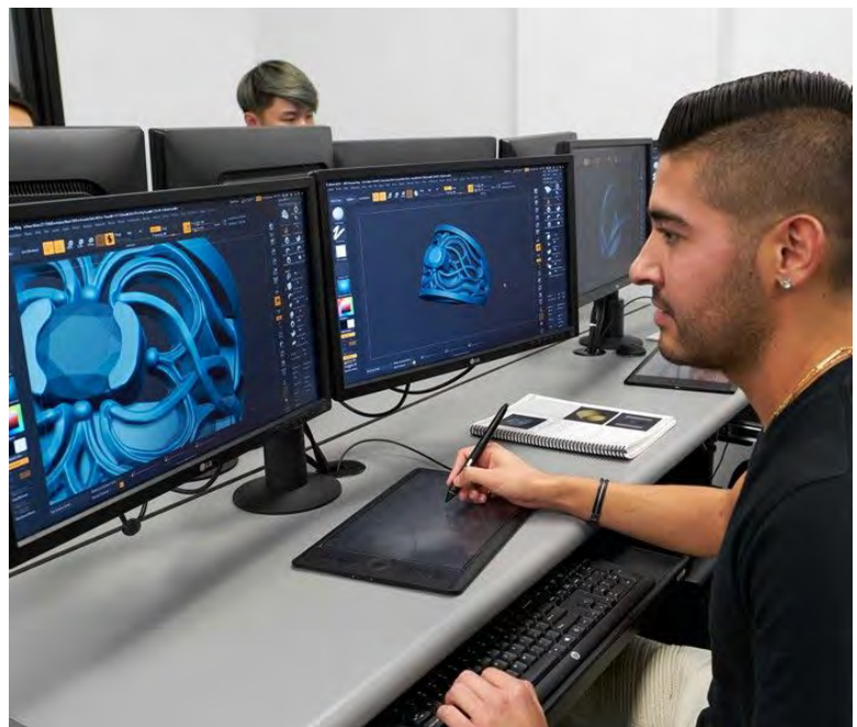
Students in GIA's Jewelry Design & Technology Program