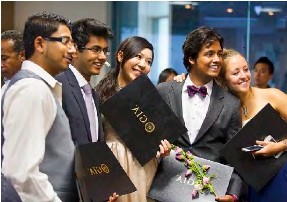
GIA On Campus Program Graduates

*Each practical exam allows for multiple attempts, see course syllabi for details.