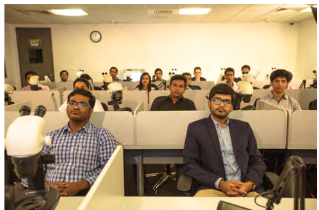
Top: Library; Bottom: Student Lounge; Bottom: Gemmology Classroom