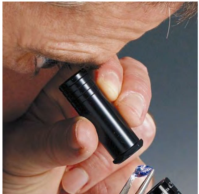
Gem Identification Lab students learn the proper use of gemological equipment like a polariscope (top) and dichroscope (bottom)