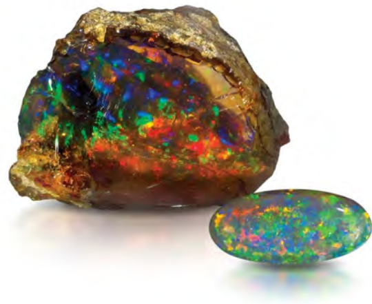
Rough and polished opal.

Note: Support for Windows 8.1 and earlier, as well as MacOS 11 and earlier, is no longer available. Requirements subject to change; students will be given advanced notice of changes.