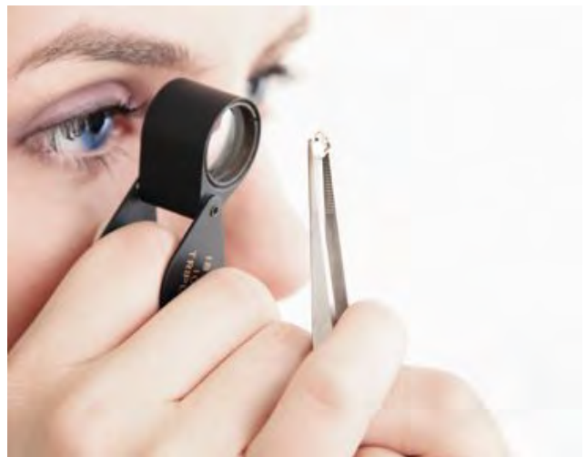
Diamond Grading Lab students assess a diamond's clarity using a 10X jeweller's loupe