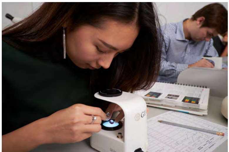
Students use gemological equipment to identify coloured stones - ©GIA