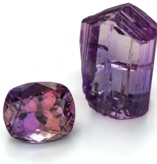
Tanzanite crystal and polished gem.

Note: Support for Windows 8.1 and earlier, as well as MacOS 11 and earlier, is no longer available. Requirements subject to change; students will be given advanced notice of changes.