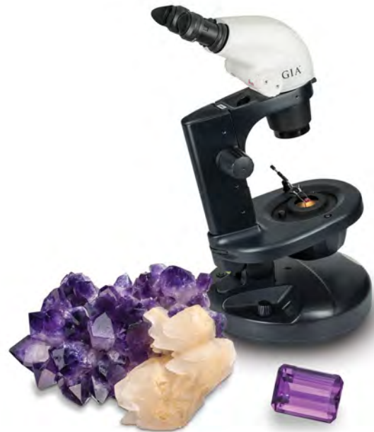
GIA microscope; rough and polished amethyst - ©GIA

Note: Support for Windows 8.1 and earlier, as well as MacOS 11 and earlier, is no longer available. Requirements subject to change; students will be given advanced notice of changes.