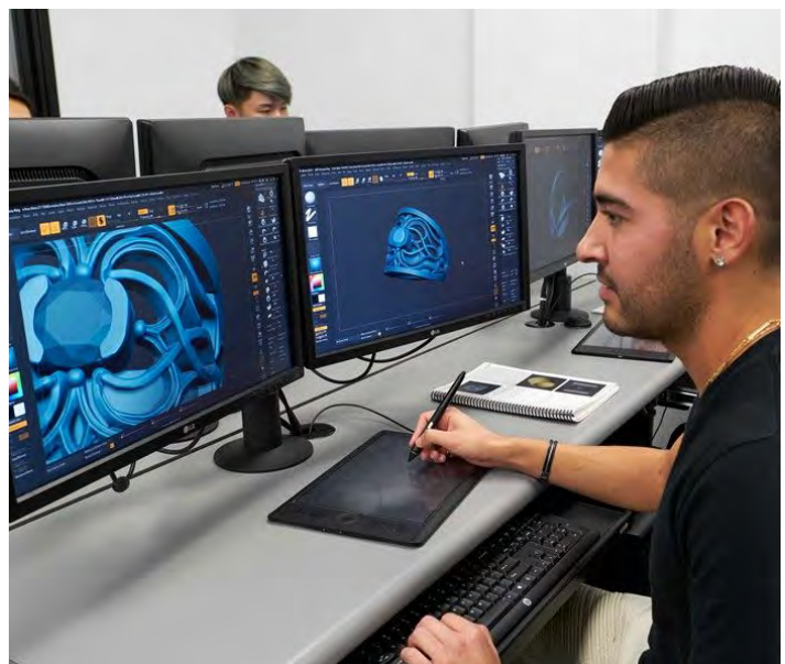
Students in GIA's Jewelry Design & Technology Program