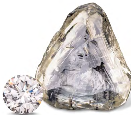
Rough and polished diamonds

Note: Support for Windows 8.1 and earlier, as well as MacOS 11 and earlier, is no longer available. Requirements subject to change; students will be given advanced notice of changes.