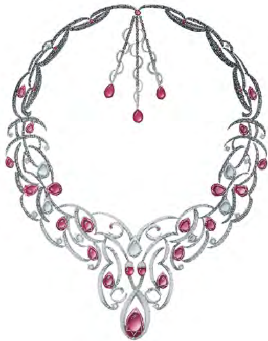
Hand-rendered necklace

Note: Support for Windows 8.1 and earlier, as well as MacOS 11 and earlier, is no longer available. Requirements subject to change; students will be given advanced notice of changes.