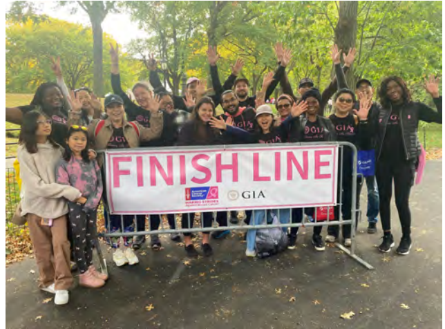
GIA participating in American Cancer Society's Making Strides

Our faculty, staff and students participate in community service and volunteering throughout the year benefiting organizations such as New York Cares, Hour Children, American Cancer Society and Toys for Tots. While you're on campus, be sure to get involved and share your ideas for service.