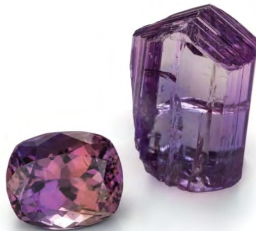
Tanzanite crystal and polished gem.

Note: Support for Windows 8.1 and earlier, as well as MacOS 11 and earlier, is no longer available. Requirements subject to change; students will be given advanced notice of changes.