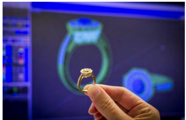
Students use CAD software and 3D printers as rapid prototyping system to design & manufacture jewelry

GIA provides computers, graphic tablets and software for classroom use. For home use, the materials fee includes a graphic tablet and pen, a student license for Rhinoceros software and a six-month trial for the ZBrush software.