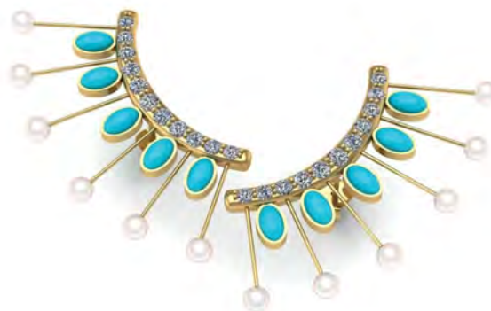
CAD-rendered earrings