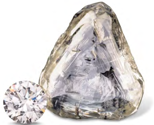
Rough and polished diamonds

Requirements subject to change; students will be given advanced notice of changes.