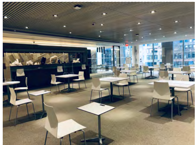
Top: IGT building entrance to NY Campus; Bottom: Student commons