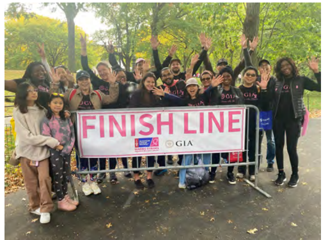
GIA staff participating in American Cancer Society's Making Strides

Our faculty, staff and students participate in community service and volunteering throughout the year benefitting organizations such as New York Cares, Operation Hope, American Cancer Society and Toys for Tots. While you're on campus, be sure to get involved and share your ideas for service.