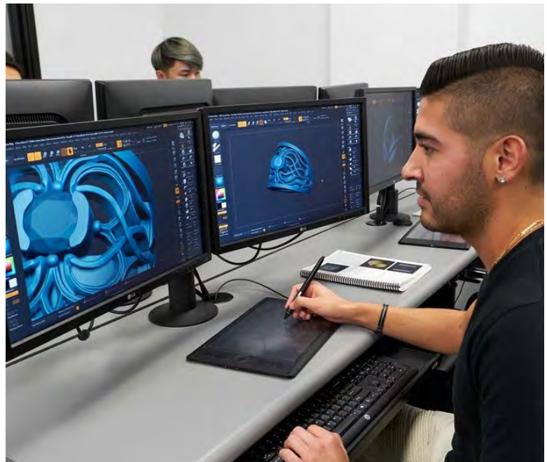
Students in GIA's Jewelry Design & Technology Program